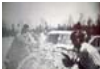
19_Household – 1964 – Allan Kaprow