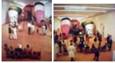
18_SHE -A Cathedral – 1966 – Nikki de Sant-