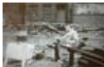
07_Photo of Rauschenberg