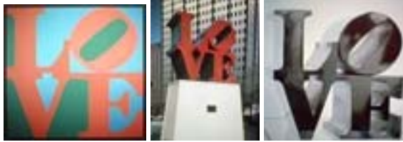
11, 12, 13_Love – 1972 –