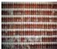
04_ 210 Coca-Cola Bottles –1962 – Andy Warhol