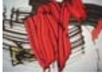
10_Big Painting no 6 – 1965 – Roy Lichtenstein