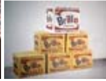
03, 03A_Brillo Boxes – 1964 – Andy Warhol