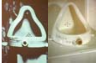
20_ & 21_ Fountain – 1917 – Duchamp