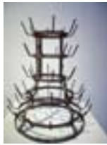
22_ Bottle Rack - 1914 – Duchamp